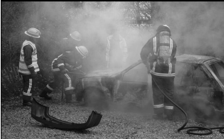
Firemen tackling the smouldering car in the Mill car park at around 7am in the morning

On Monday 25th February, villagers were shaken at approximately 7am by an explosion in the Mill car park. Within minutes, acrid smoke and flames had engulfed the area and were threatening to spread to the trees and shrubs along the riverbank.